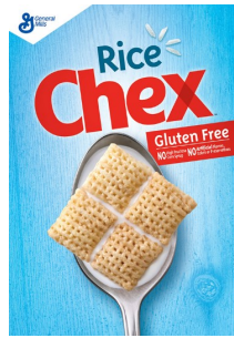
General Mills Rice Chex