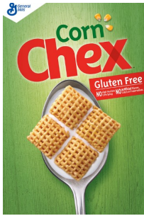
General Mills Corn Chex