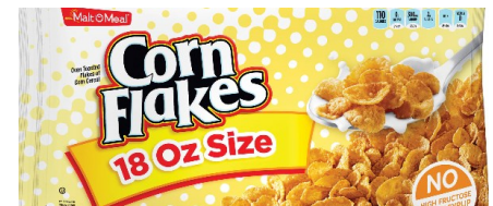
Malt-o-Meal Corn Flakes