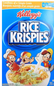
Kellogg's Rice Krispies