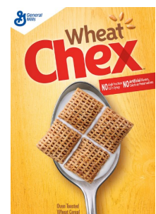
General Mills Wheat Chex