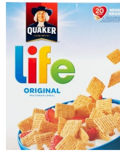
Quaker Life Original