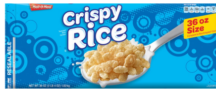
Malt-o-Meal Crispy Rice