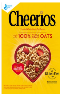
General Mills Cheerios