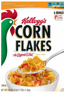
Kellogg's Corn Flakes