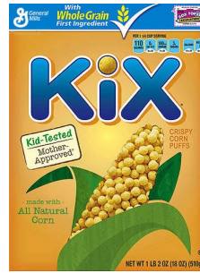
General Mills Kix