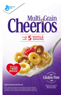
General Mills MultiGrain Cheerios